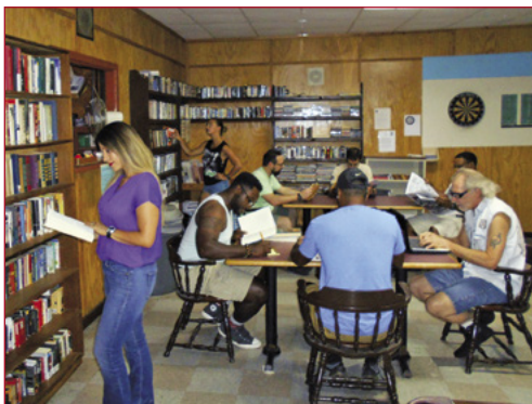
Reading Room, USS Diego Garcia.