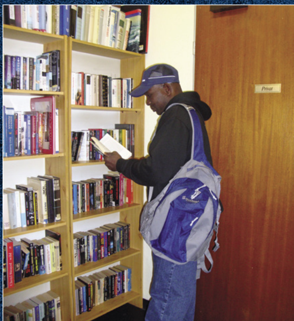
Seafarer browsing for a "Good Read," USS Bremerhaven, Germany.