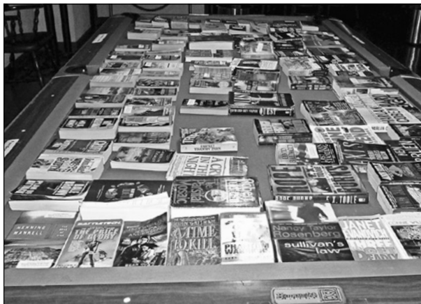
Book Exchange, “Take One – Leave One,” USS Yokohama, Japan

“The Captain of a ship stands on the bridge alone As he brings his vessel and crew safely home The Pilot or Mates plot the rocks and the reefs Their skill aboard brings great relief A drastic course change lends to some tension Sharp, watchful eyes heed what needs mention A break in the mist is a welcomed sight Whether it occurs in daytime or during the night The long voyage home is finally ended” When the last mooring line to the shore has been bended.”